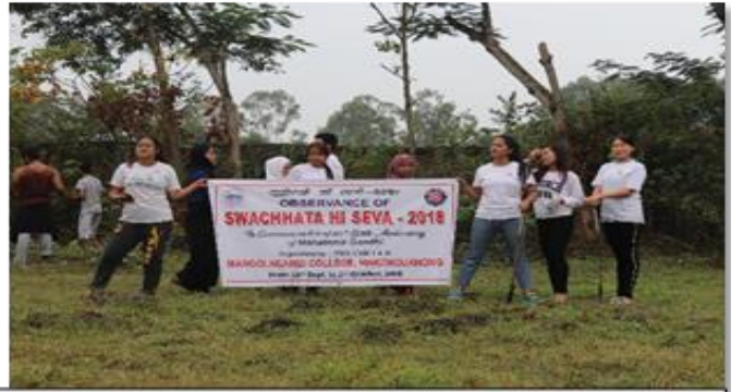
Swachhata Hi Seva to commemorate Birth Day of Mahatma Gandhi, 2nd October, 2018