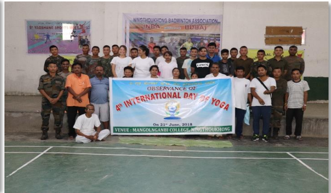
Observance of International Yoga Day, 2018