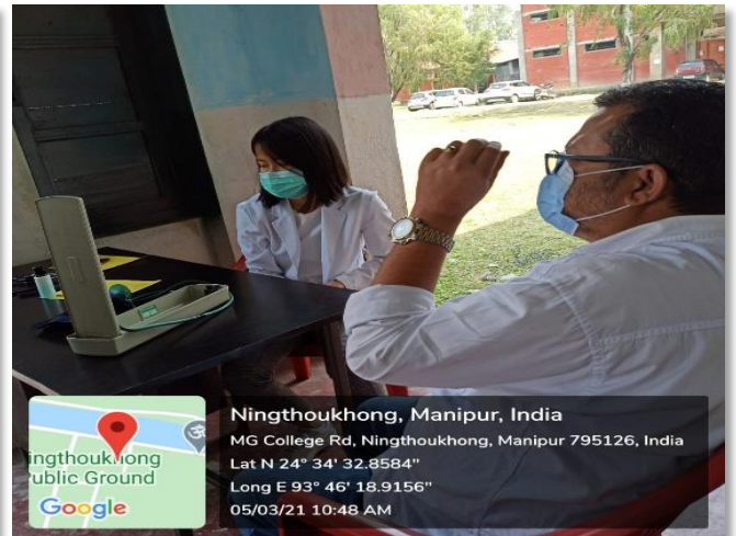
Blood Donation Camp, 2021