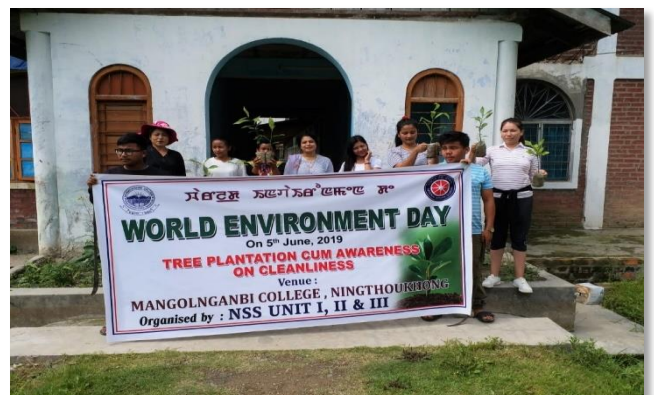
World Environment Day, 5th June, 2019